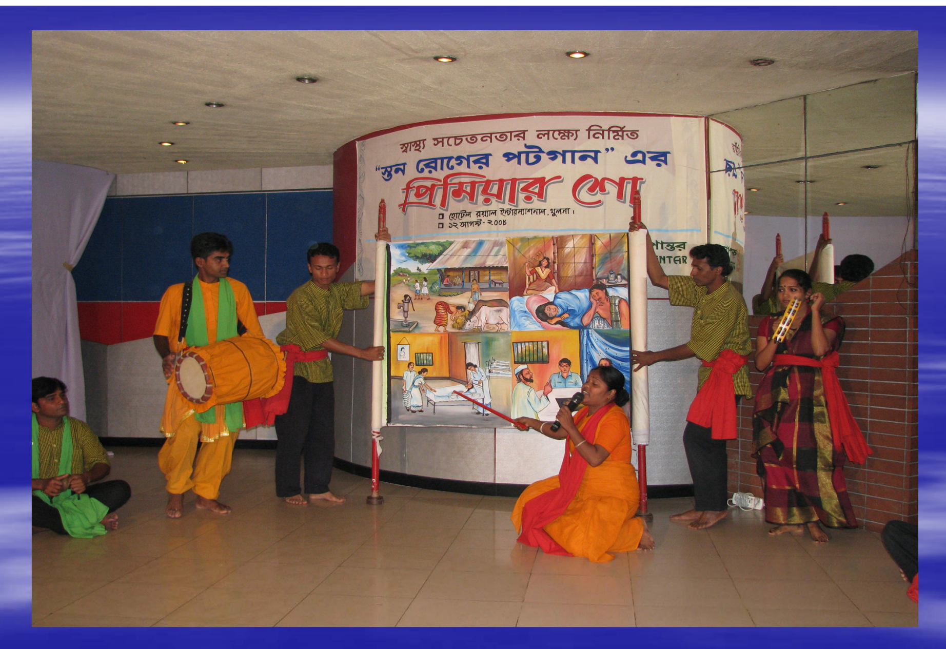
Cultural education: Rupantar Performance art "Pot Song" on Breast Problems