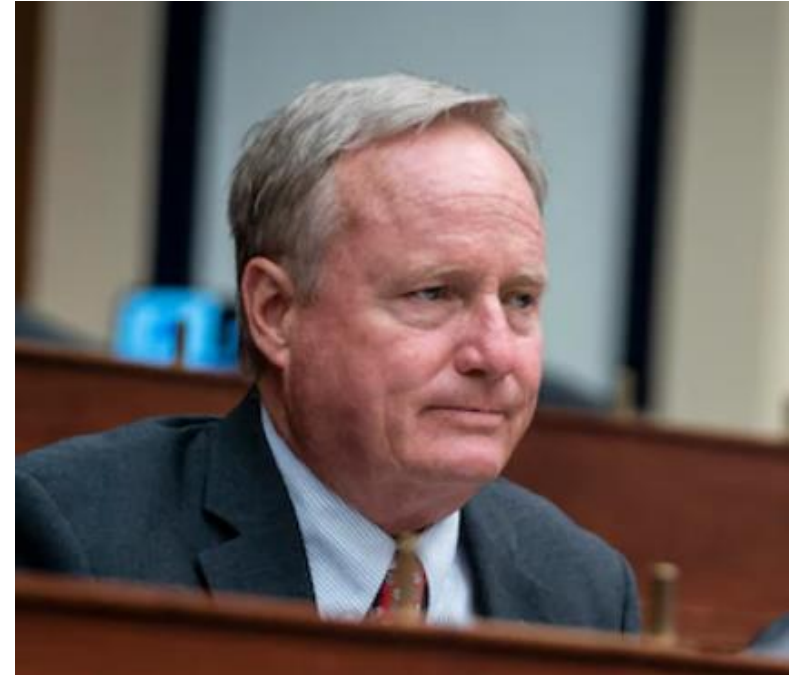
Representative Dave Joyce (R-OH) In Congress Since 2013