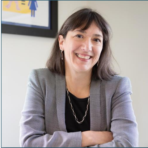
Dr. Monica Bertagnolli NIH Director