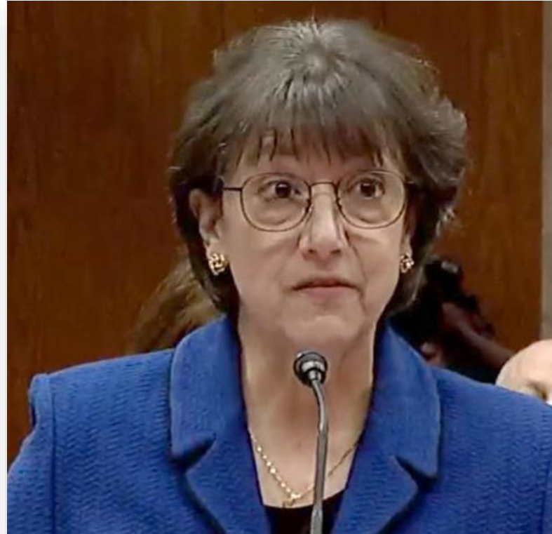
Dr. Monica Bertagnolli NIH Director