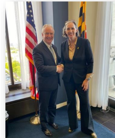
Senator Chris Van Hollen (D-MD) Member, Appropriations