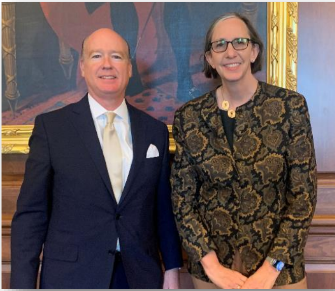
House Appropriations L-HHS Subcommittee Chair Robert Aderholt (R-AL)