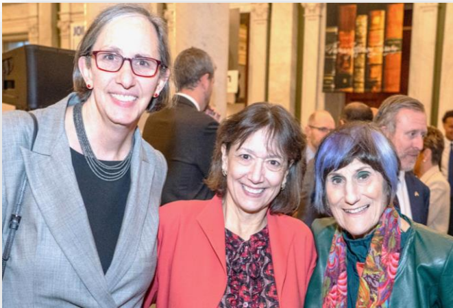
House Appropriations Committee Ranking Member Rep. Rosa DeLauro (D-CT)