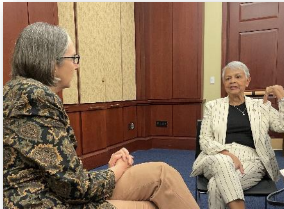
Rep. Bonnie Watson Coleman (D-NJ) Member, L-HHS Appropriations