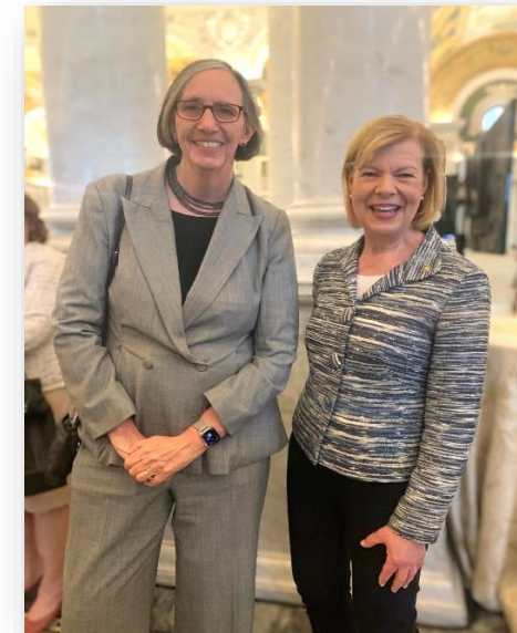
Senate Appropriations L-HHS Subcommittee Chair Tammy Baldwin (D-WI)