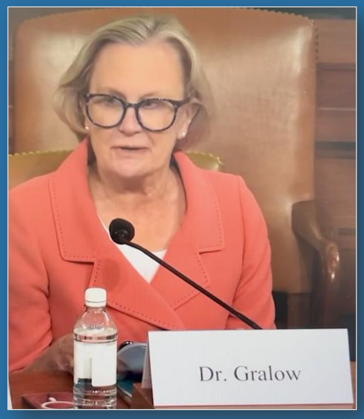
House Ways & Means Hearing on Drug Shortages February 6, 2024