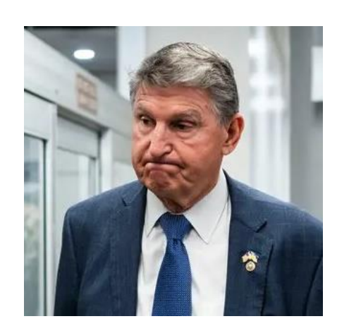
Sen. Joe Manchin (D-WV), Member, L-HHS Appropriations Subcommittee

Approximately 45 House members (more than 20 from each party) and 7 Senators (5 Democrats and 2 Republicans) <a href="https://have.nnounced.plans">have announced.plans</a> to leave office. The majority are retiring or seeking another office.