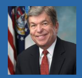
L-HHS Subcommittee Ranking Member: Roy Blunt (R-MO)