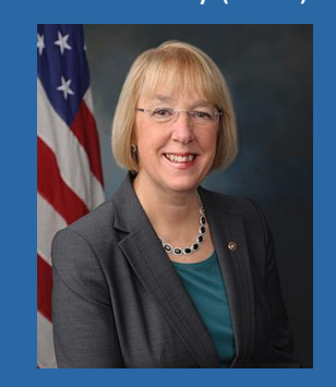
L-HHS Subcommittee Chair: Sen. Patty Murray (D-WA)