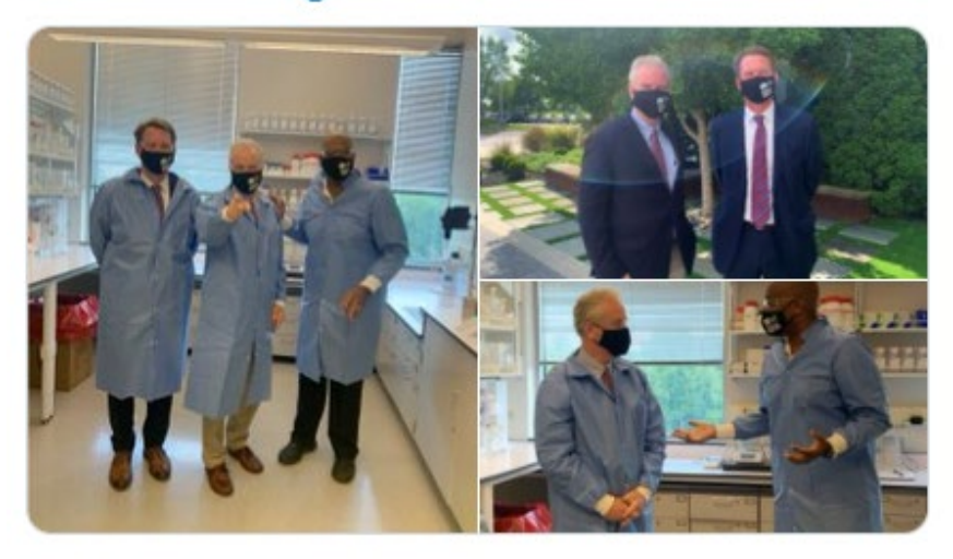
6:42 PM · Sep 9, 2021 · Twitter Web App