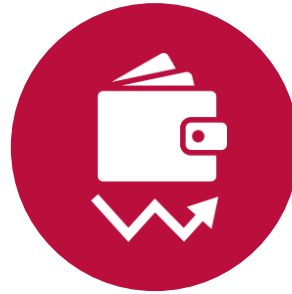
Out-of-pocket indirect costs (related to medical care)