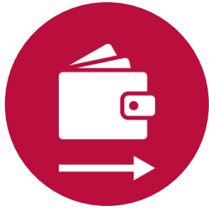
Out-of-pocket direct costs (medical care)