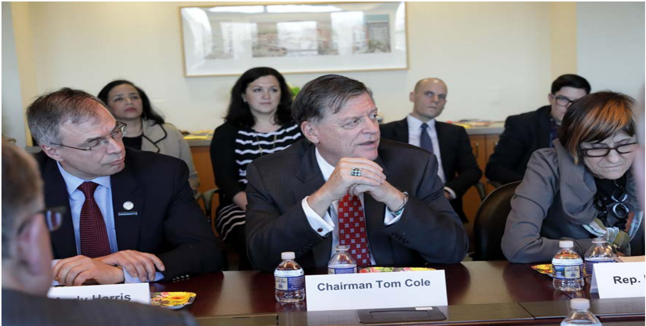
Third Annual Visit of House Labor-HHS Appropriations Subcommittee