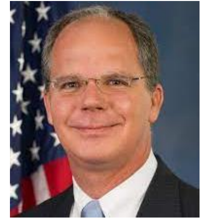
Ranking Member Brett Guthrie (R-KY)