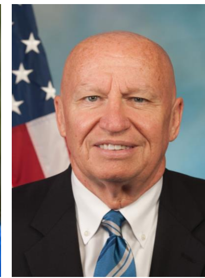
Rep. Kevin Brady