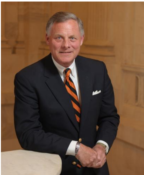
Senator Richard Burr