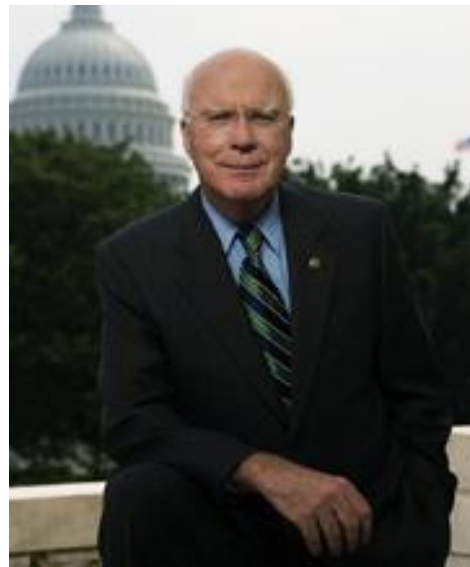
Senator Patrick Leahy