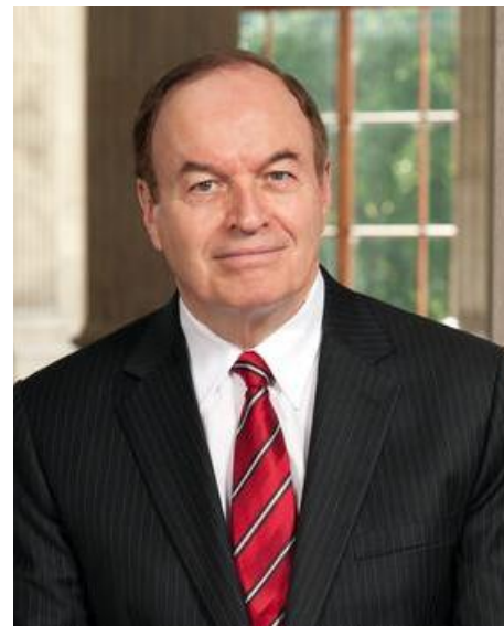
Senator Richard Shelby