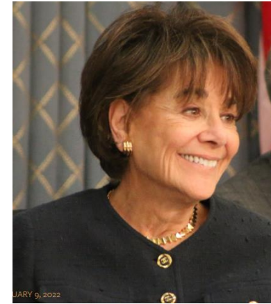
Chair Anna Eshoo (D-CA)

Once approved, the measures – the Advanced Research Projects Agency for Health Act (H.R. 5585), introduced by Eshoo, and Cures 2.0 (H.R. 6000), introduced by DeGette and Upton – would not only create a new Advanced Research Projects Agency for Health, known as ARPA-H, to find new cures and treatments for some of the world's most difficult diseases, but would also provide the new agency the framework it needs to be successful.