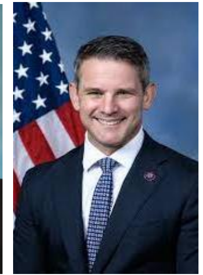
Rep. Adam Kinzinger