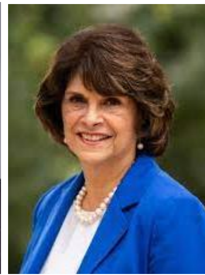
Rep. Lucille Roybal-Allard