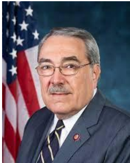
Rep. GK Butterfield