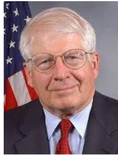
Rep. David Price