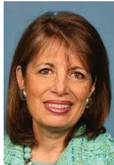
Rep. Jackie Speier