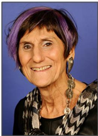
Rep. Rosa DeLauro (D-CT) Ranking Member, Appropriations Committee

"You cannot pass appropriations bills without them being both bipartisan and bicameral. The president will not sign. So I think this notion that you can deal with 2022 levels... you then may be looking at guaranteeing a shutdown."