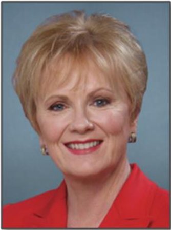
Rep. Kay Granger (R-TX) Chair, Appropriations Committee

"I don't support cutting defense. That's the one that I'm really, really hard-core on."