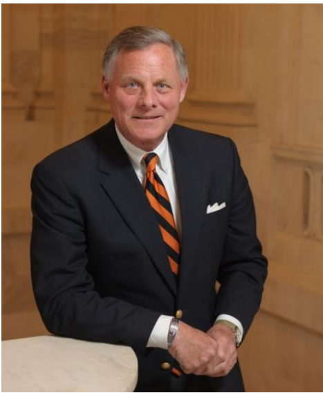
Senator Richard Burr