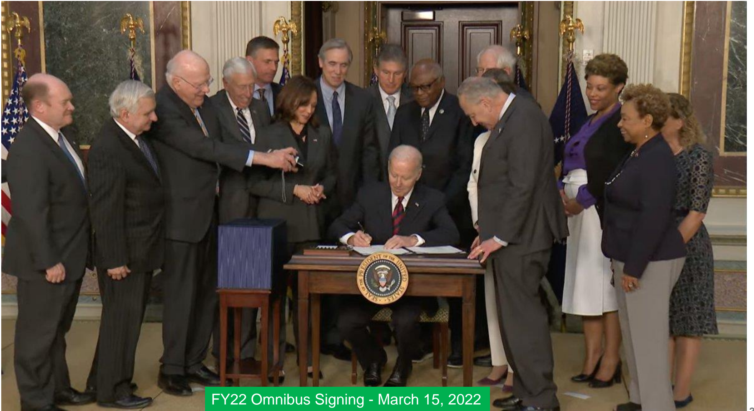
FY22 Omnibus Signing - March 15, 2022