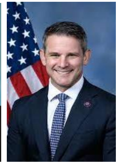
Rep. Adam Kinzinger