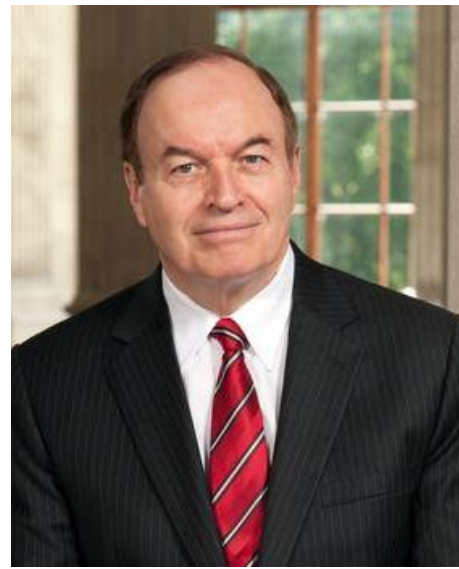
Senator Richard Shelby