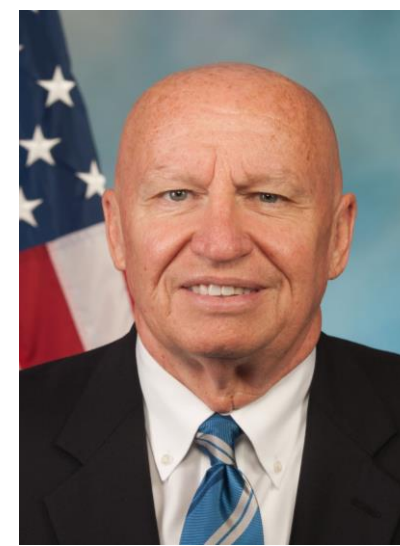
Rep. Kevin Brady