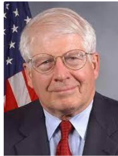
Rep. David Price