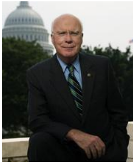
Senator Patrick Leahy