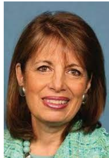
Rep. Jackie Speier