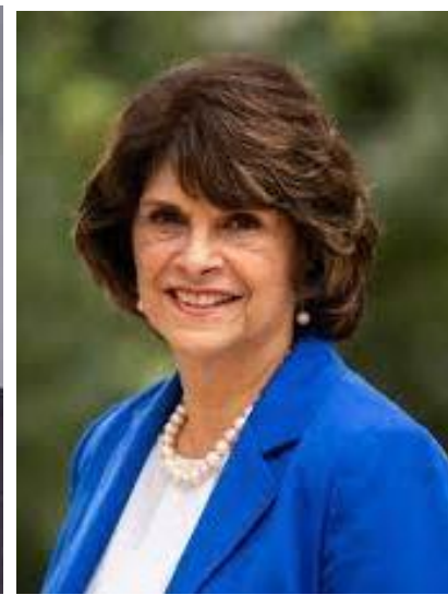
Rep. Lucille Roybal-Allard