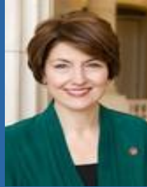
Full Committee Ranking Member: Cathy McMorris Rodgers (R-WA)