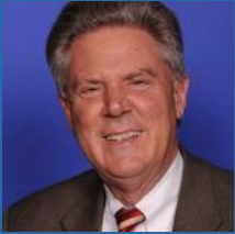
Full Committee Chair: Frank Pallone (D-NJ)