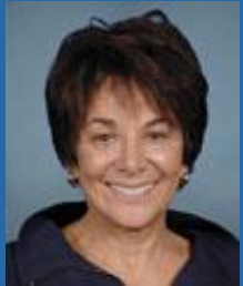
Health Subcommittee Chair: Anna Eshoo (D-CA)