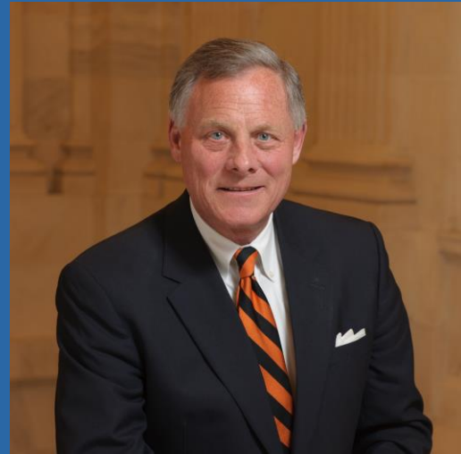
Ranking Member Richard Burr (R-NC) Retired: Lamar Alexander (R-TN)