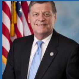
L-HHS Subcommittee Ranking Member: Tom Cole (R-OK)