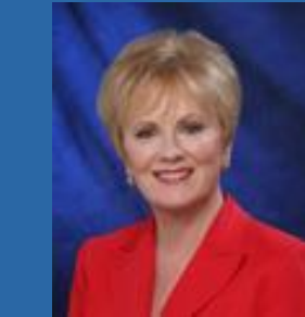
Full Committee Ranking Member: Kay Granger (R-TX)