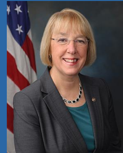
L-HHS Subcommittee Chair: Sen. Patty Murray (D-WA)