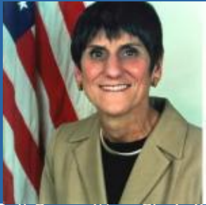
Full Committee Chair & Labor-HHS SC Chair Rosa DeLauro (D-CT)