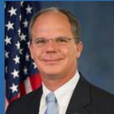
Health Subcommittee Ranking Member: Brett Guthrie (R-KY) Michael Burgess (R-TX)