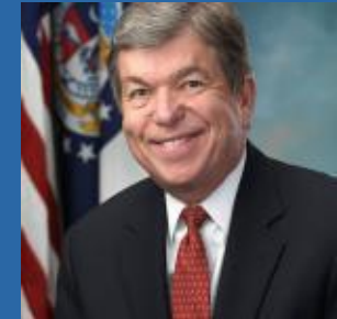
L-HHS Subcommittee Ranking Member: Roy Blunt (R-MO)