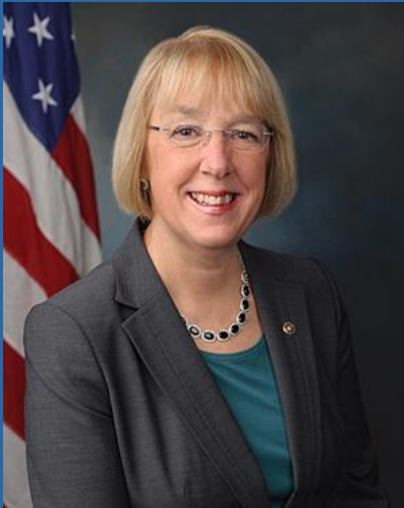
Chair Patty Murray (D-WA)