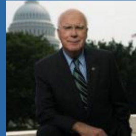
Full Committee Chairman Patrick Leahy (D-VT)