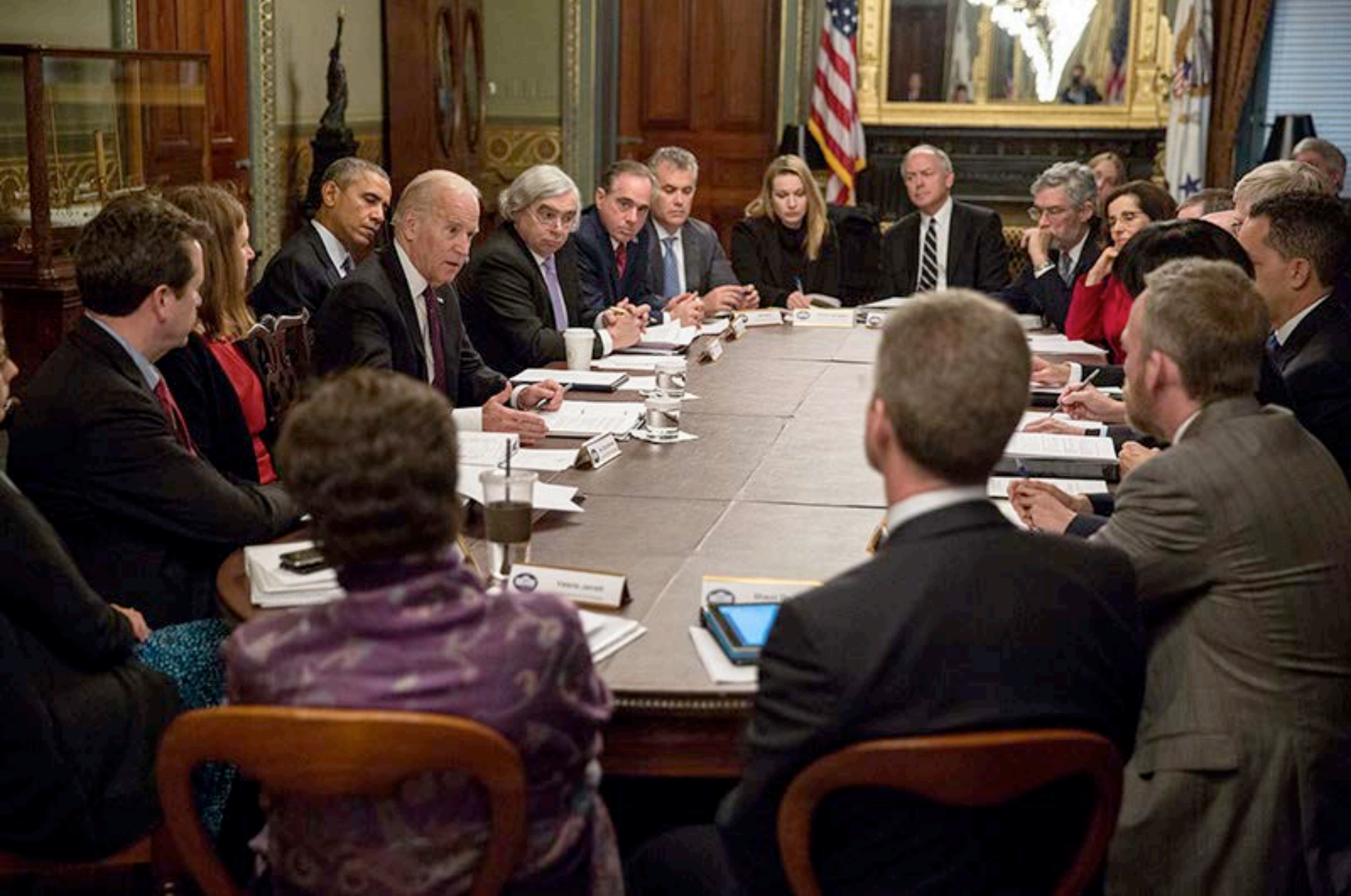
Cancer Moonshot Federal Task Force: Feb 1, 2016