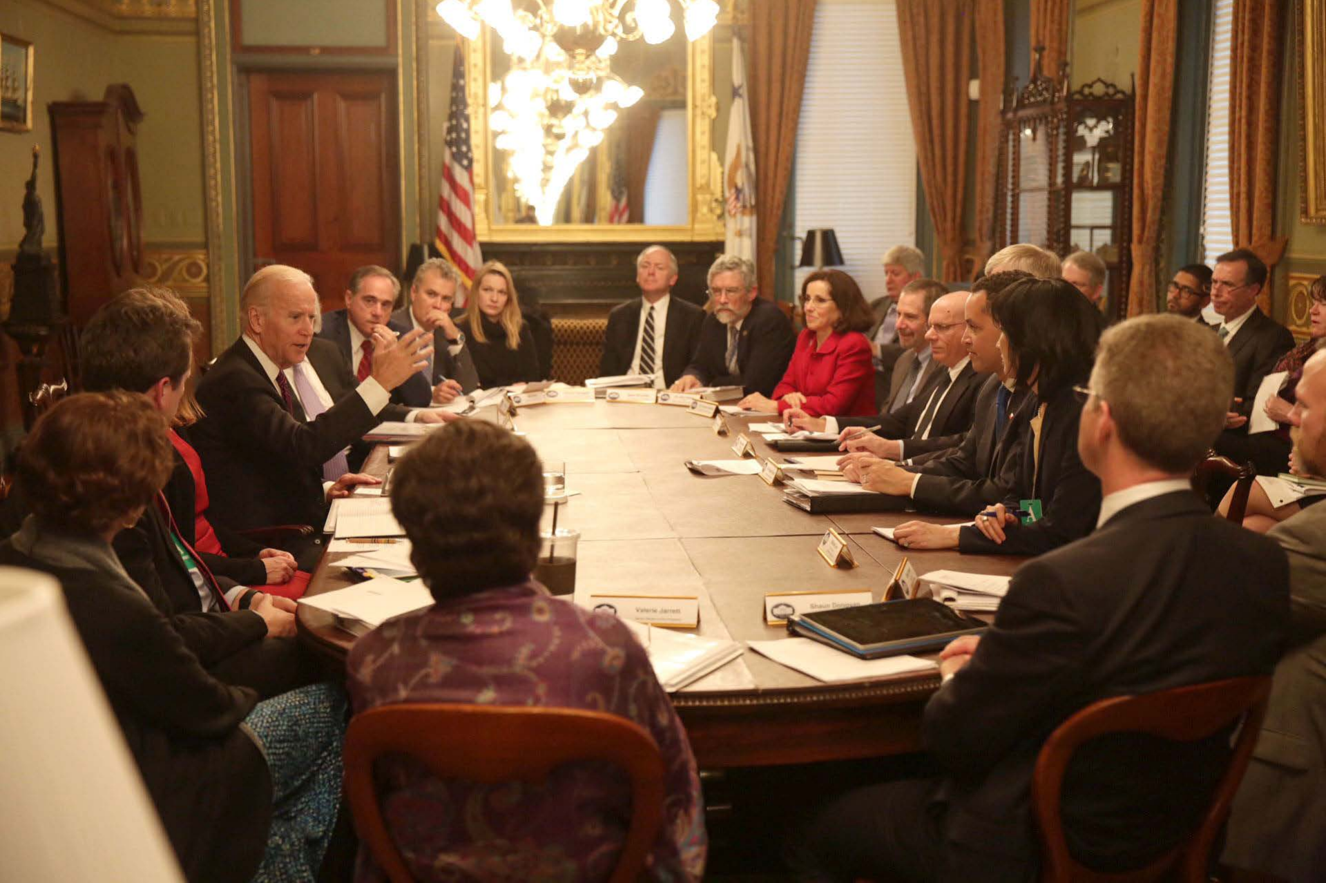
Cancer Moonshot Federal Task Force: Feb 1, 2016