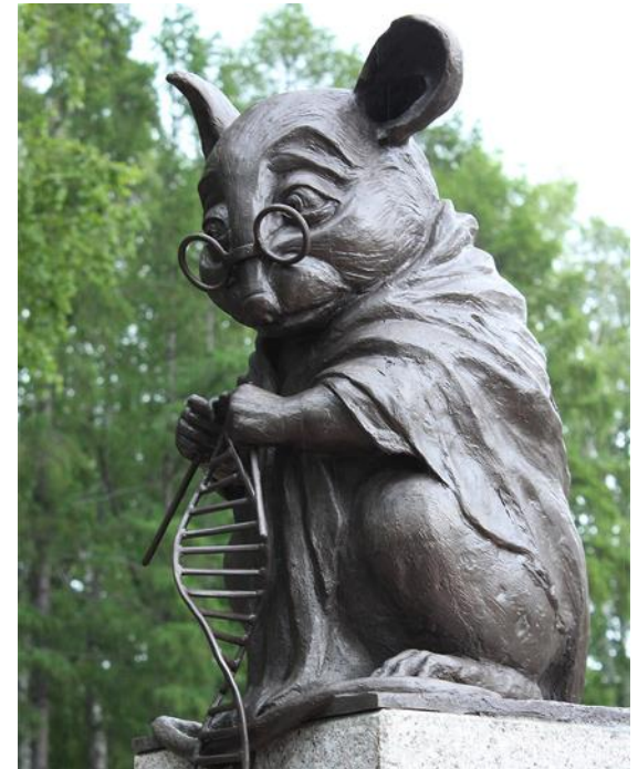
A monument to lab rats used for DNA Research. Novosibirsk, Russia.