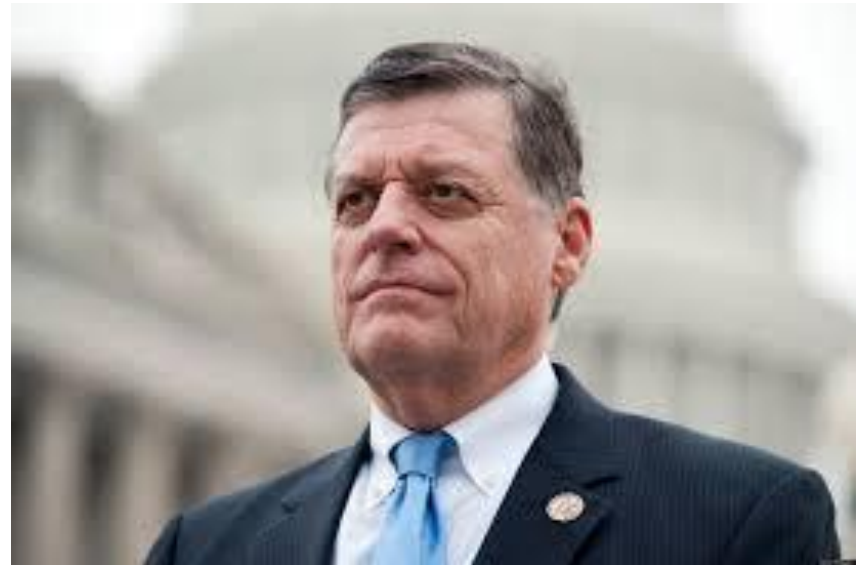
House Appropriations Labor-HHS Subcommittee Chairman Tom Cole (R-OK)

We don't have the authority to do this, No. 1. No. 2, are you talking to anyone about it? Where does this money magically come from? In our political judgment, that's not going to happen.