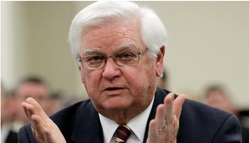
House Appropriations Chairman Hal Rogers (R-KY)

So that's why we are so dead set against mandatory increases