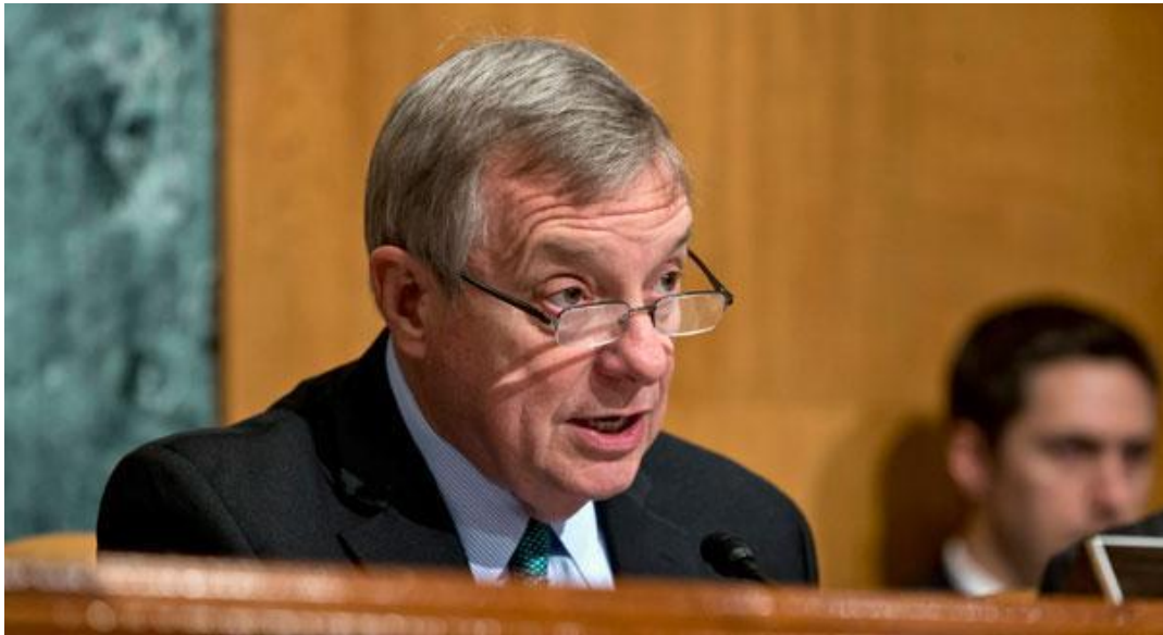
Senator Richard Durbin (D-IL) Senate HELP Committee(s) – authorizer and appropriator

I will accept Senator Alexander's analysis that sometimes you cut in the areas where you know Congress is going to step in and fill the void and I hope that's the case here. But what the chairman said at the outset, counting on mandatory spending to make up the difference is a risk I hope we never take."