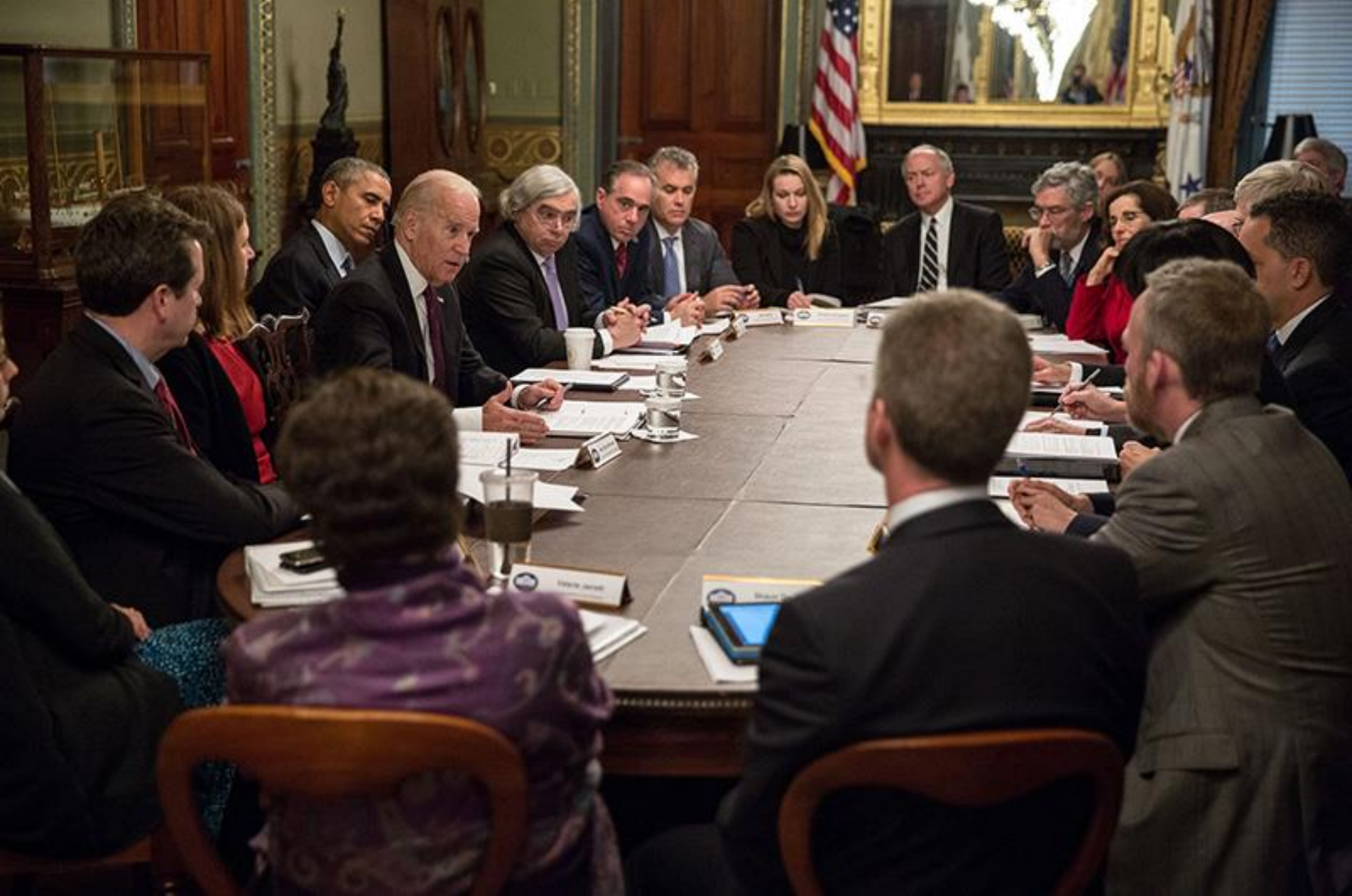
Cancer Moonshot Federal Task Force: Feb 1, 2016